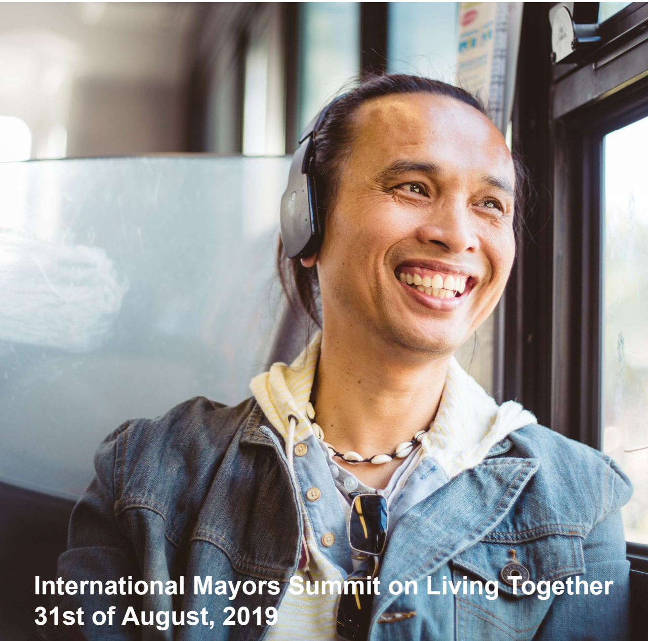
International Mayors Summit on Living Together 31st of August, 2019