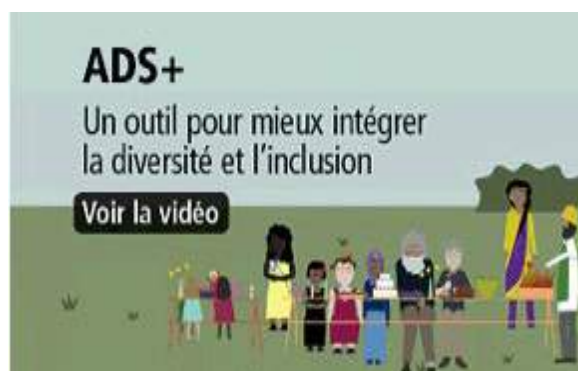
Image of the Video which present the Gender-differentiated analysis tool ADS+ for city employees

The deployment of ADS has revealed that the support and development of practical tools are essential conditions for success. The political will and openness of staff to innovate and adapt is also equally important to integrate this approach to all programmes and municipal services.