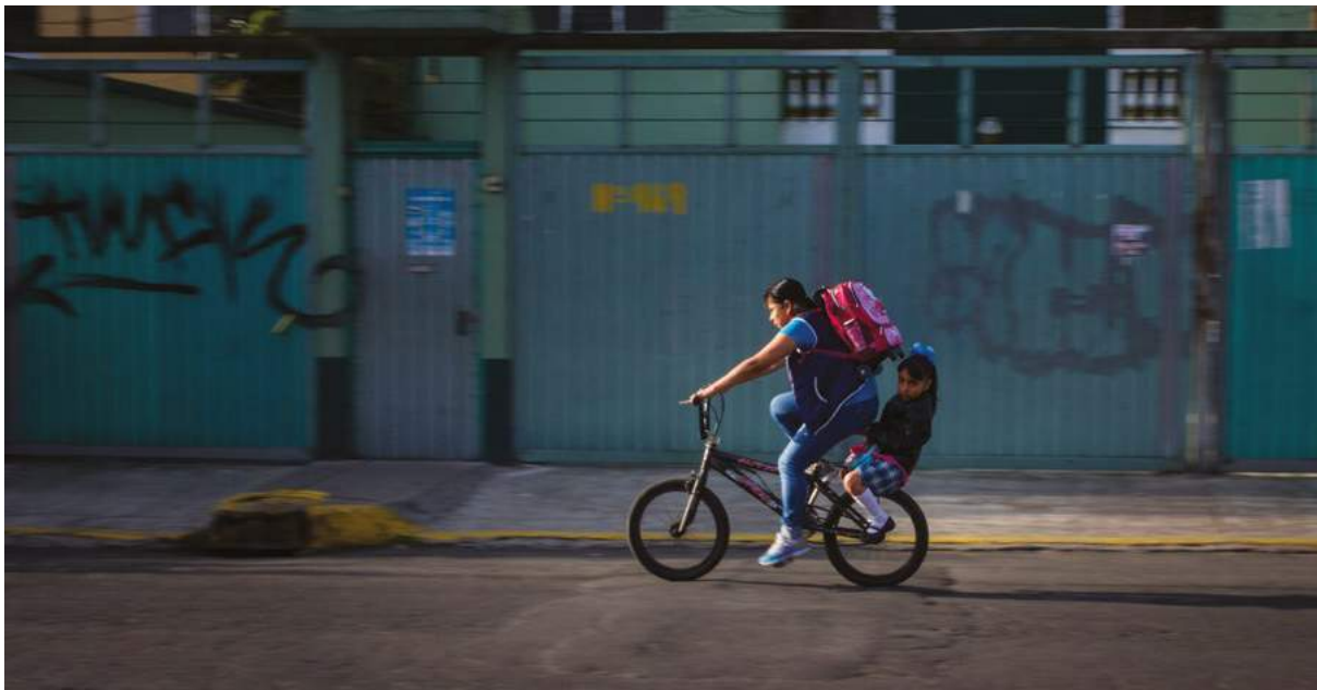
Guadalajara and Monterrey Safe City initiatives are strengthening the role of women’s organizations in monitoring women’s safety in public spaces.

In addition, two virtual sessions are provided one month after the training with each participant organization to address any questions and doubts regarding the process. By the end of the training, each organization will submit a final report including key findings and the next steps for their respective policy and legislative advocacy plans.