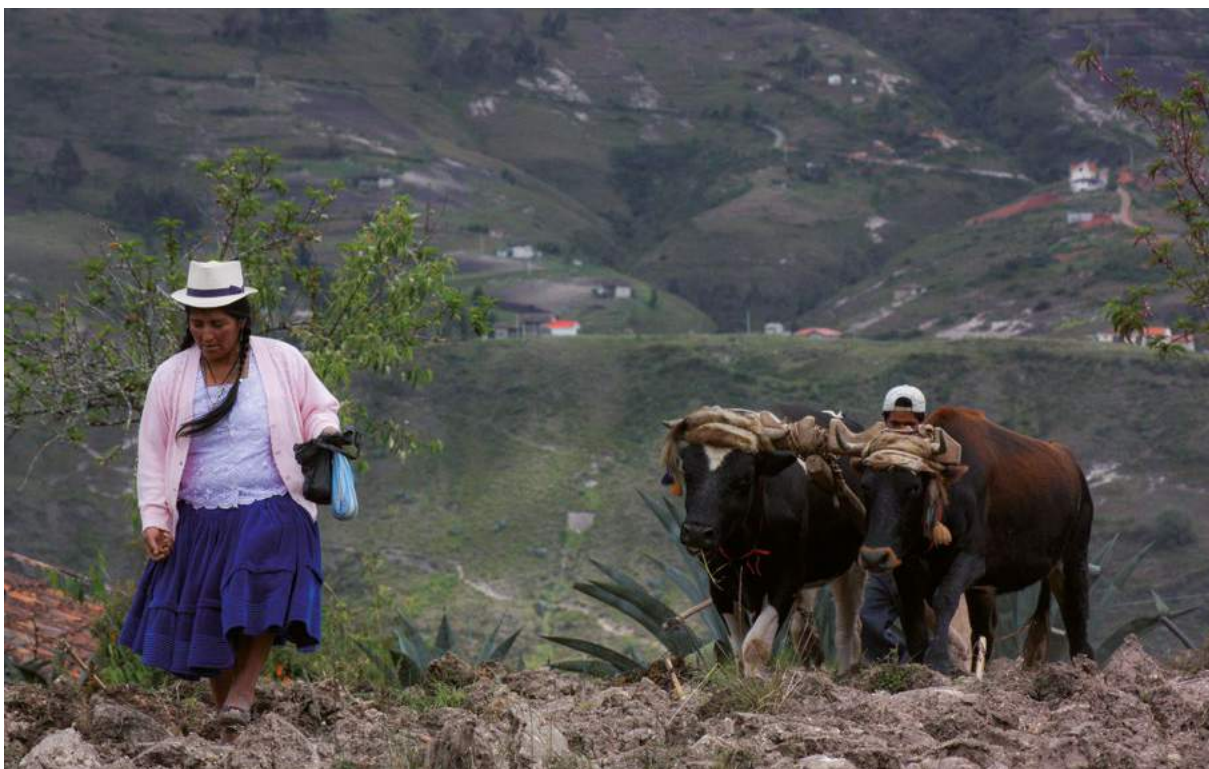
This geographical diversity in Cuenca requires site-specific data collection and analysis in rural public spaces to gain a deep understanding of sexual violence against women, women's access to public spaces and identify the needs and concerns of rural women.

• Capacity-building measures. Capacity assessments, targeted training, and other measures will be developed to enhance strategic and effective responses to prevent and respond to VAWG by the police and justice in rural settings, including cases of SH.