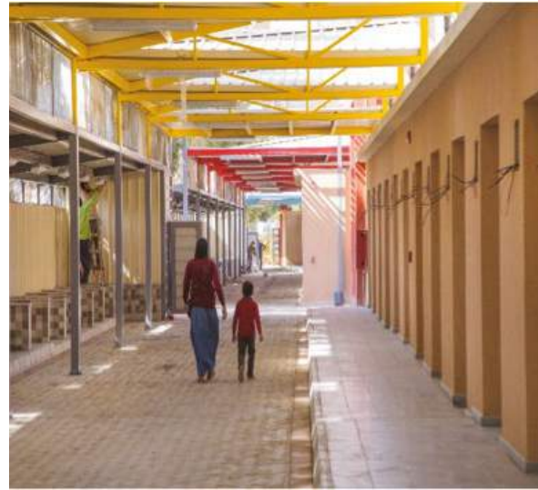
Zenin Market: Before (left image) and after the intervention (right image) to create a safe and accessible city for all.

The market design process included six months of consultation with market users and vendors and studies conducted by specialists, including architects, environmental, waste and gender consultants. Through this consultation process, women with disabilities explained their specific needs in accessing the market stalls, bathrooms and the additional barriers they may experience when using the market.