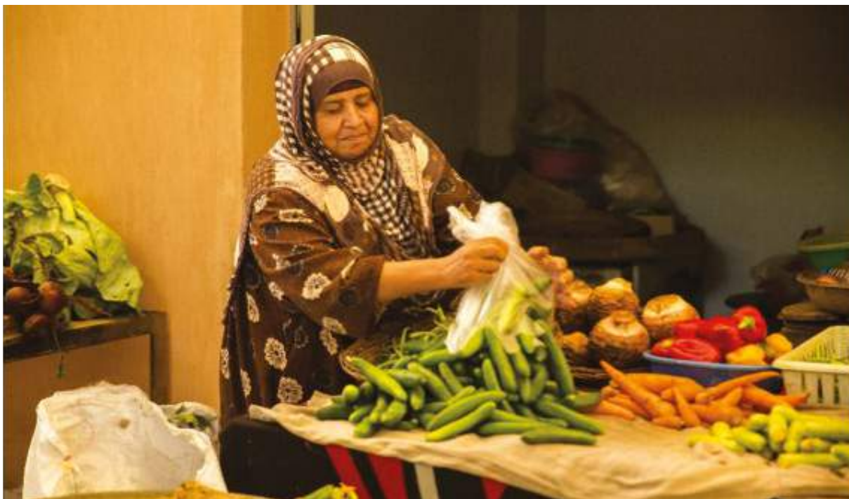
The Zenin market in Cairo represent an important livelihood option for women vendors who represent the majority of market users.

The Zenin market offers a working space for more than 70 women who belong to different age groups (ages 24 to 75). The women contribute to their households, whether by providing the sole source of income to the family or contributing significantly to it. Many of the women in the market also contribute to their married children households, helping to support their grandchildren to school, and contributing to health expenses for their siblings and family in laws. The women and men working in the market have been there since the early 90s and aspire to grow it further.