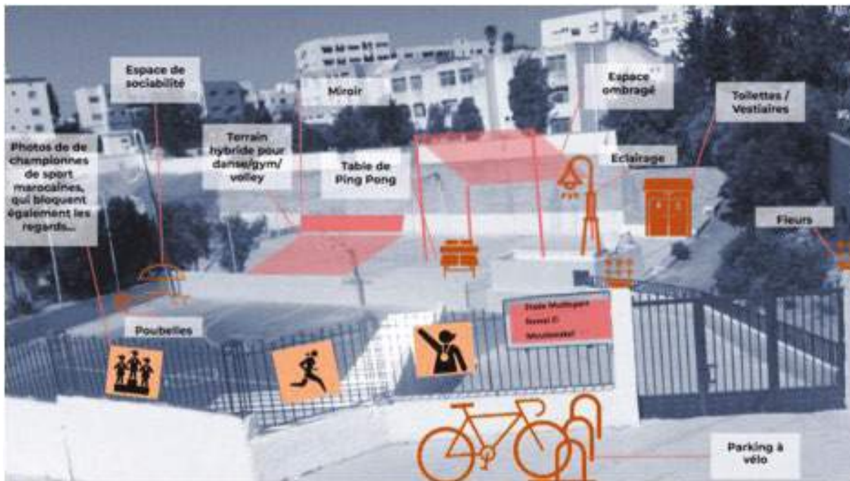
The gender-responsive guidelines developed by the Ministry of Housing and UN Women highlight design principles to support safe and inclusive public spaces that promote women and girl's safe mobility and access to services.

concerns expressed by women and girls by addressing simultaneous discriminations that women and girls face in Moroccan cities. During the validation process in different states, the study identified specific barriers to services and needs by women and girls with disabilities, women and girls who do not speak Arabic, women in care-related roles, and elderly women, including those with limited resources and/or education. 40