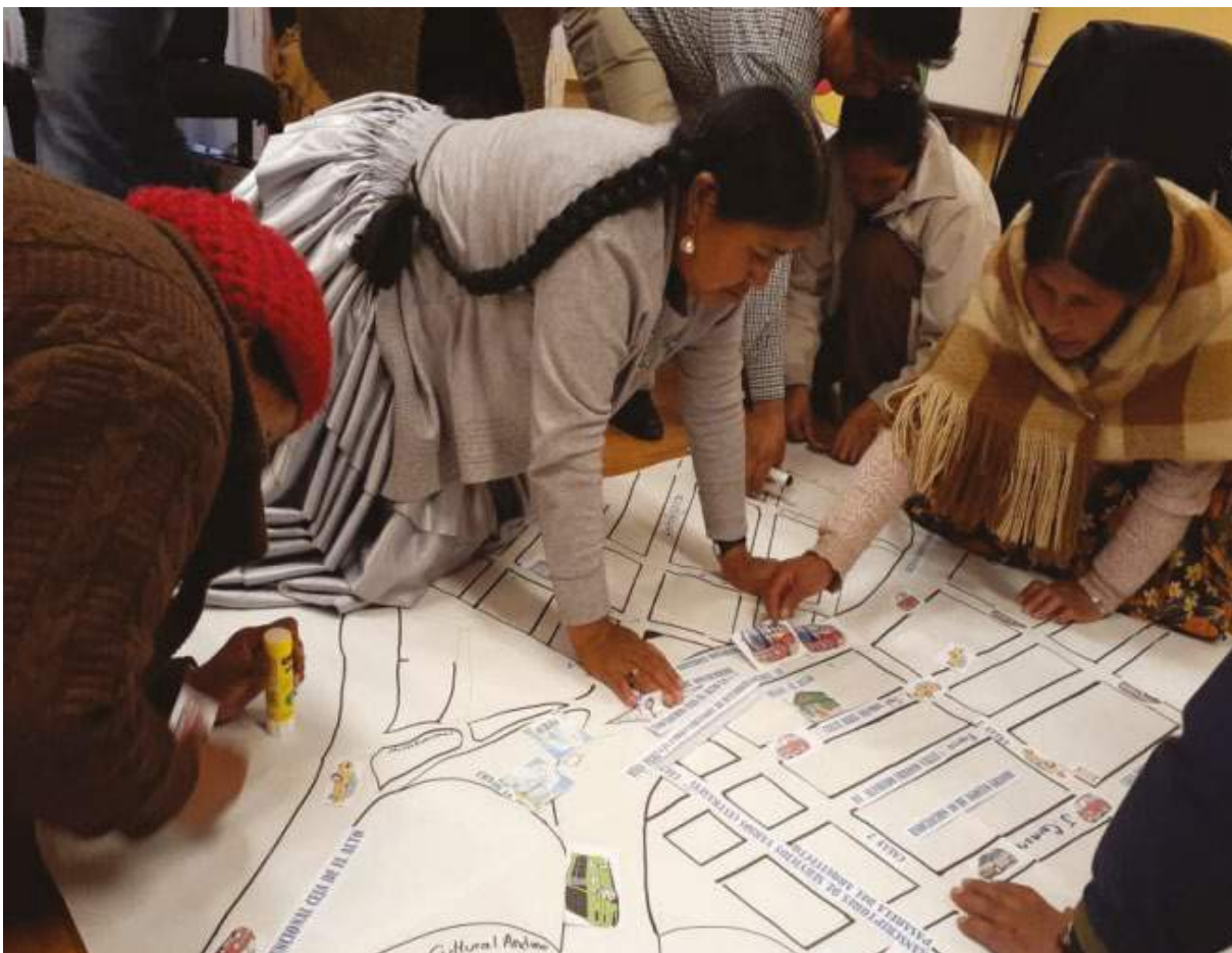
Aymara women identify safe spaces and community support in the city of El Alto.

With the support of the city of El Alto’s Urban Development Unit, the maps were built to scale and placed in strategic locations in the neighborhood as a tool to help migrant Aymara women transit the city and identify community resources, including access to services. The community map will be a living document that can continue to receive inputs.