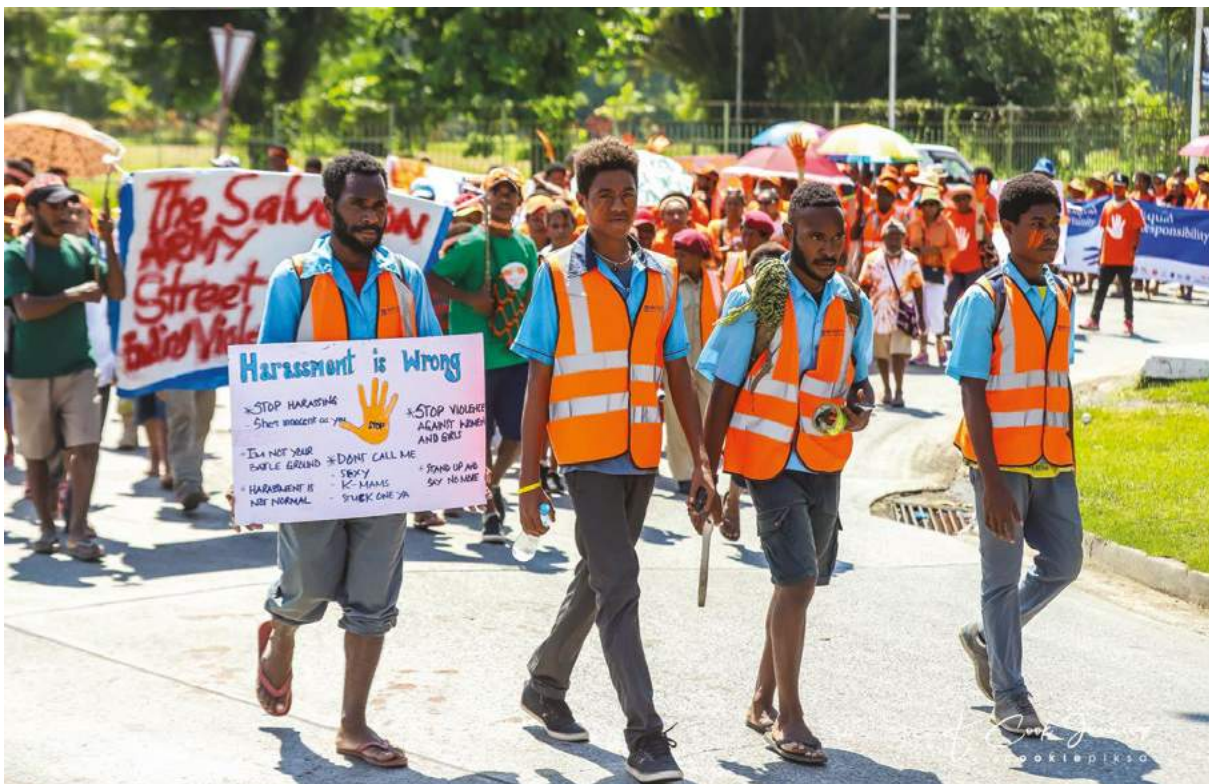
As part of a strategy to engage boys in the prevention of sexual harassment, young school boys from Bugandi secondary School in Lae, Papua New Guinea are participating in a community march to amplify messages to end sexual harassment on the Ending Violence Day arranged in country in March.

Some became yoga instructors, teaching in prisons and at various locations in other parts of the country.